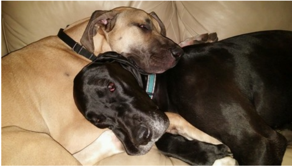
Zoey & Bruno